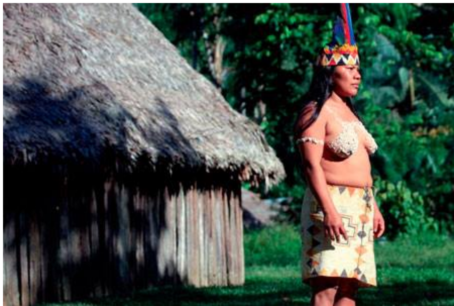
Tikuna Native Community near Leticia Amazonas

Share ancestral knowledge with local native communities near Leticia Amazonas. By the kilometres , you can find more than 3 native communities from different Amazonian ethnics. My recommendations is to visit Bora native maloca (native gathering centre) in the 7 KM .