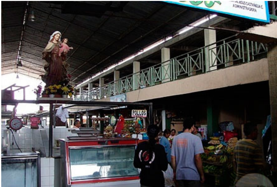
Leticia local market

If you want to know more about Leticia, visit the local market and experience an unique feeling about Leticia Amazonas gastronomy. Here you can learn about the vegetables, fruits and hundreds of different species of fishes you could find in the Amazon River. My recommendation is to eat Empanadas with Aguapanela at "Donde la profe" (right in the entrance of Leticia's Local Market).