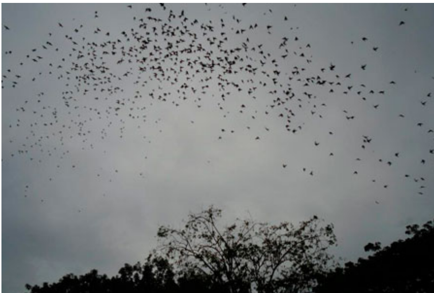
Parque Santander - Parakeet's Arrival

For more than 30 years, nearly 3,000 parakeet's arrive to the their home Santander Park's Sombrero