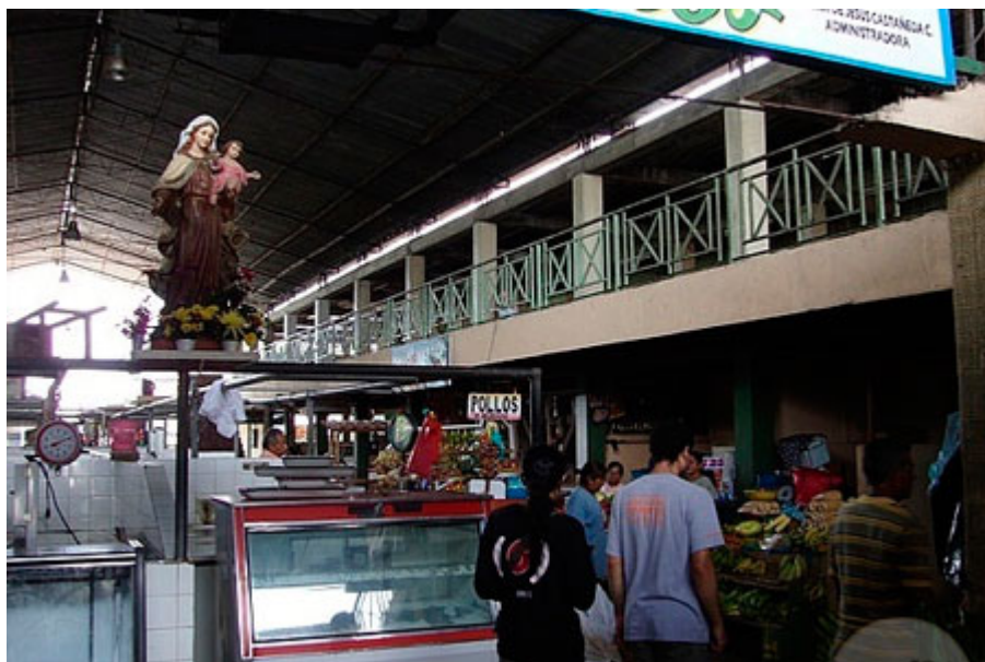
Leticia local market

If you want to know more about Leticia, visit the local market and experience an unique feeling about Leticia Amazonas gastronomy. Here you can learn about the vegetables, fruits and hundreds of different species of fishes you could find in the Amazon River. My recommendation is to eat Empanadas with Aguapanela at "Donde la profe" (right in the entrance of Leticia's Local Market).