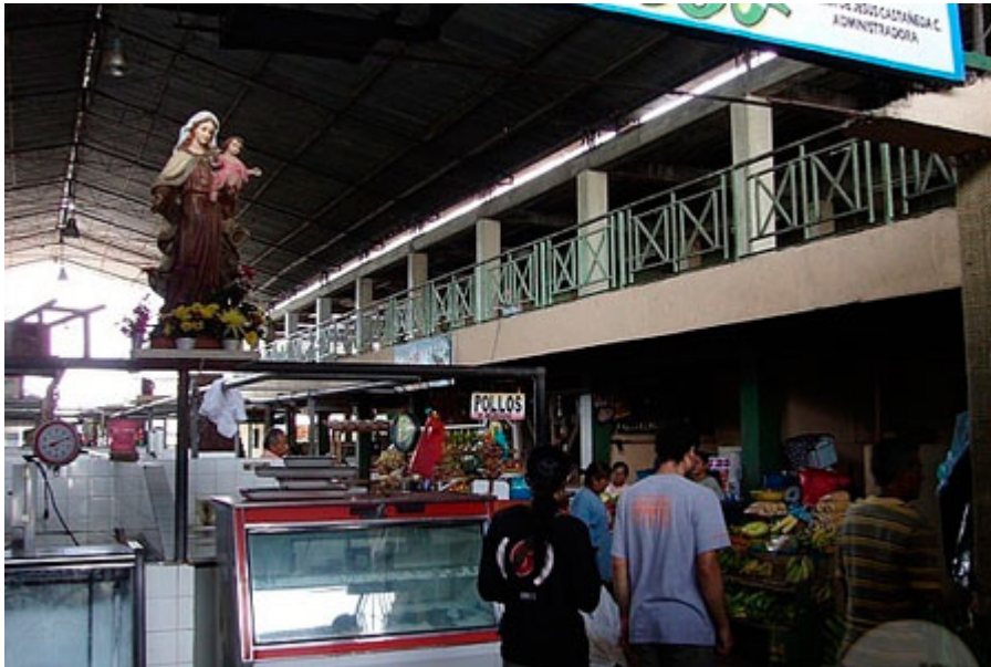
Leticia local market

If you want to know more about Leticia, visit the local market and experience an unique feeling about Leticia Amazonas gastronomy. Here you can learn about the vegetables, fruits and hundreds of different species of fishes you could find in the Amazon River. My recommendation is to eat Empanadas with Aguapanela at "Donde la profe" (right in the entrance of Leticia's Local Market).