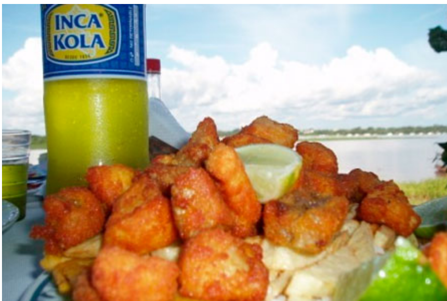
Local Amazon cuisine - Chicharron de Pirarucu