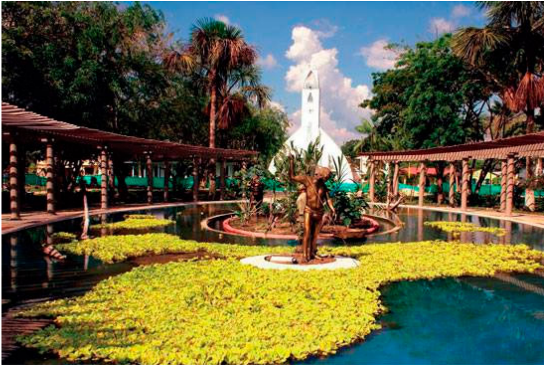
Visit Leticia Amazonas - Colombia

Visiting Leticia Amazonas is not easy, the only connection is a 2 hour flight from Bogota (2 Hour Flight) or a 20 days boat sail from Puerto Asis . Leticia, is one of the most expensive city in Colombia but the safest. These are five things you cannot miss while taking a vacation in our city.