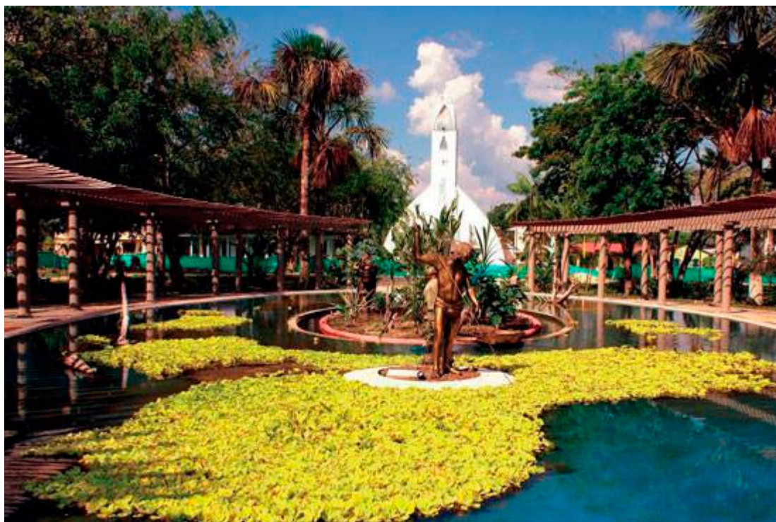
Santander Park in Leticia Amazonas

Leticia (Colombia) is a small city located in the middle from Iquitos (Peru) and Manaus (Brasil). It has been an important city to connect travellers going from Peru to Brasil or backwards. There is no road to get here from Bogota, Iquitos or Brasil. You have to take a plane from Bogota to Leticia. From Iquitos, there are boat service (fast boat - slow boat) arriving at Santa Rosa (Peru) or plane. If you want to arrive from Manaus, there are only boat service and plane arriving to Tabatinga.