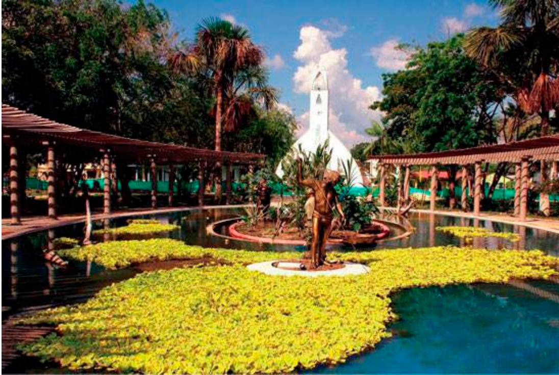
Santander Park in Leticia Amazonas

Leticia (Colombia) is a small city located in the middle from Iquitos (Peru) and Manaus (Brasil). It has been an important city to connect travellers going from Peru to Brasil or backwards. There is no road to get here from Bogota, Iquitos or Brasil. You have to take a plane from Bogota to Leticia. From Iquitos, there are boat service (fast boat – slow boat) arriving at Santa Rosa (Peru) or plane. If you want to arrive from Manaus, there are only boat service and plane arriving to Tabatinga.